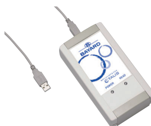
Smart cards loading terminal